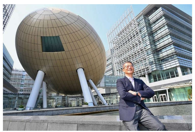
Photo 1: The Financial Secretary, Paul Chan, visited Science Park to exchange views with green technology startups in promoting Hong Kong's green development.