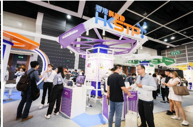
Photos 1-4: The HKSTP Pavilion at the Hong Kong International Medical and Healthcare Fair featured 24 Park companies and their biomedical technology innovations and solutions.