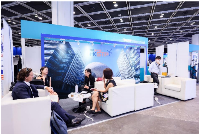
Photo 8: HKSTP also participated in the Asia Summit on Global Health to exchange insights and explore collaboration opportunities with healthcare experts, academia, business leaders, investors and policymakers from around the world.