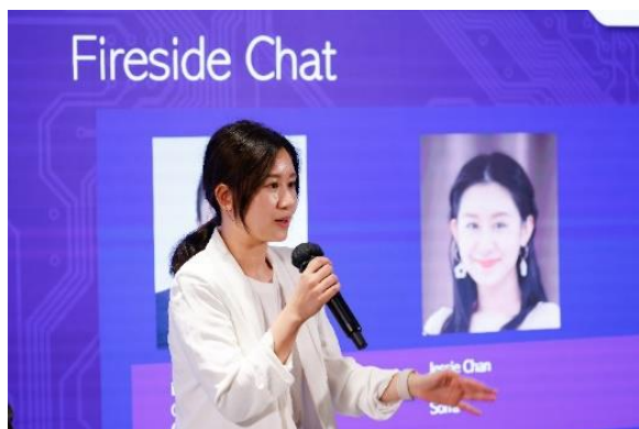
Photos 5a to 5c: HKSTP has invited representatives from local leading startups, such as “Alphabag”, “Asynk” (Photo 5a), “Cloudbreakr” (Photo 5b), and “Sorra” (Photo 5c) to join in the “Youth Startup Leaders Sharing” session.