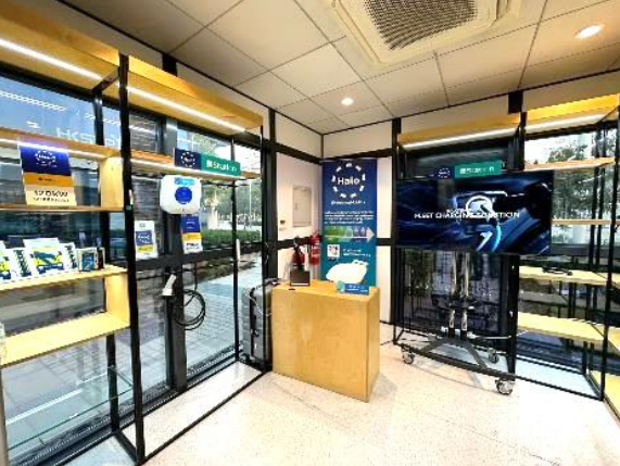
Photos 11-12: "COP28 shed light on climate change, how to move energy systems away from fossil fuels in a just, orderly, and equitable manner, thereby accelerating the achievement of science-based net-zero emissions." – Halo Energy. At COP28, the company has established connections with potential clients and investors in the Middle East market, paving way for future growth and business expansion.