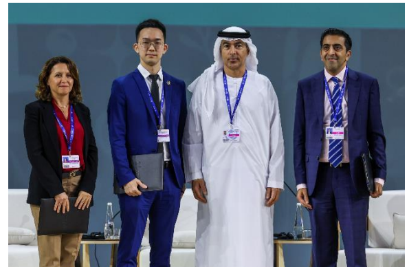
Photo 8: Intensel, an alumnus of HKSTP and a Hong Kong climate risk analytics firm, won a top award at COP28 UAE TechSprint among 126 submissions from 31 countries. Its Al-driven climate analytics platform for measuring and translating climate hazards into financial risk at the asset level was selected as the overall winner under the Al category.