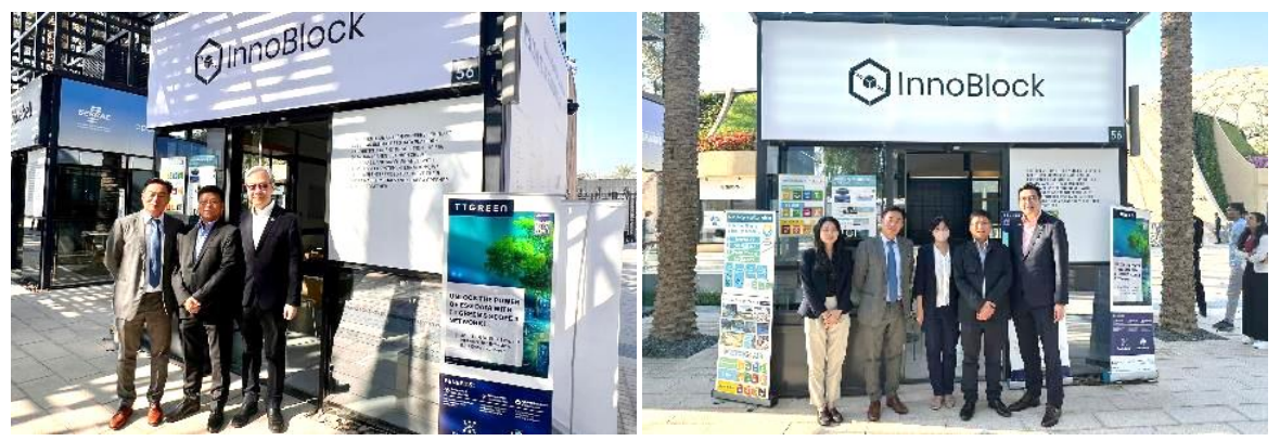
Photos 15-16: "We must swiftly reduce coal, oil, and gas production, triple global renewable power capacity by 2030, and significantly boost funding for adaptation and climate resilience." — InnoBlock. With the global attention on its TT Green solution in COP28, the company is exploring business opportunities in the UK, South Africa, Germany, and Taiwan.