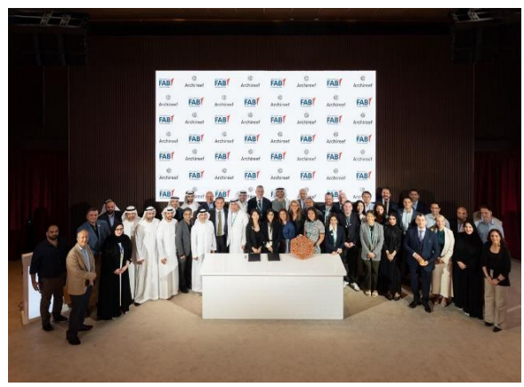
Photo 6: Archireef, a nature tech company and HKSTP's Elevator Pitch Competition (EPiC) 2021 winner, signed an MoU with First Abu Dhabi Bank (FAB), one of the largest banks in the Middle East North Africa (MENA) region. This collaboration aims to rejuvenate the deteriorating coral reefs in the UAE's Arabian Gulf using Archireef's patented technology involving 3D-printed terracotta clay tiles.