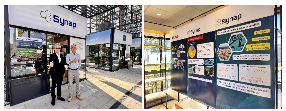
Photos 21-22: "COP28 has escalated methane emission reduction to a global agenda, where we found our role in the Belt and Road Initiative." – Synap Technologies. At COP28, Synap Technologies established a connection with the Global Methane Hub, which has the first-ever global platform to track and measure methane emissions from waste using satellite monitoring. On this basis, the company will gradually link up its efforts in methane reduction with the world based on its green tech experience in Hong Kong.