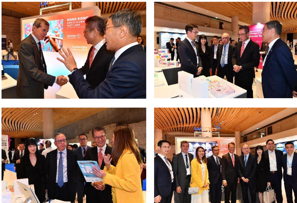
Photo 3-6: Mr Paul Chan, Financial Secretary of the HKSAR Government, visited the HKSTP Pavilion to discover the latest products and applications in Hong Kong’s biotech and healthcare industry.