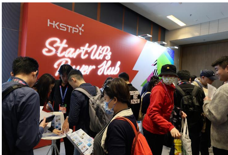
Photo 6: The new “StartUP Power Hub” zone made its debut with dynamic engagement between young and aspiring entrepreneurs and over 30 startup founders.