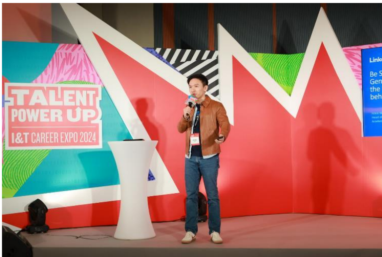
Photo 4: Leveraging LinkedIn's database and algorithm, participants acquired tactics that were seen by Gen AI and the recruiters behind it, maximising one's employability.