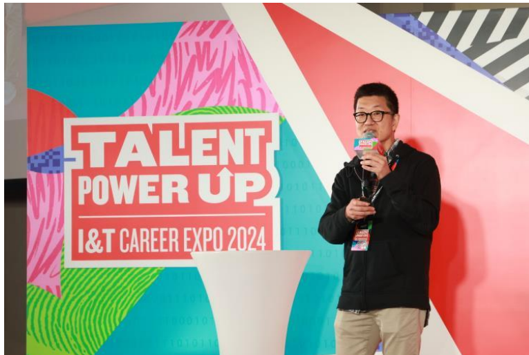
Photo 5: Google Strategic Advisor's comprehensive forecast of where Gen AI is impacting industries will help participants make the most of the trends in 2024.