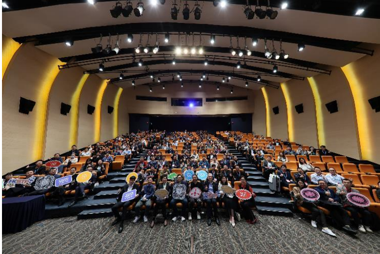
Photo 7: An exclusive career and entrepreneurship sharing session was held for non-local talents, giving them an overview of the distinctive advantages of Hong Kong I&T development, golden opportunities in the thriving ecosystem and the comprehensive support available to talent from all over the world.