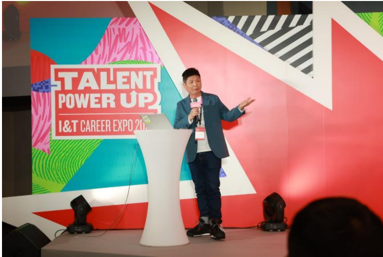
Photo 3: AWS delivered a 101 workshop to arm job seekers with essential knowledge and know-how of Generative AI.